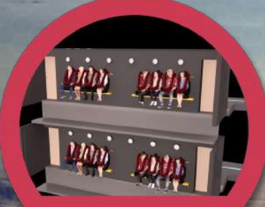
Special Effect Seats